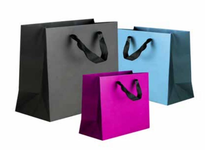
If you're looking for a stock design we will gladly work with you to deliver a solution that matches your business needs.

Higher & wider bags are available to accommodate boot & shoe boxes with a variety of paper strength and handles. Add a little bow to the bag to make the customer's purchase complete!